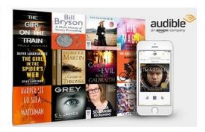
2-Month Audible.com.au Membership