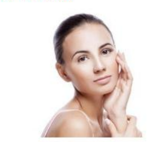
2-Hour Pamper Package Amalia Day Spa